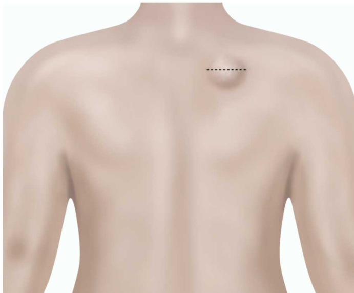
Removing a lipoma

To remove a lipoma, your surgeon will make a straight cut on your skin directly over it. The lipoma is freed up from the tissues around it and removed. They will close the cut with stitches which, depending on the operation, can be removed in about 5 days.