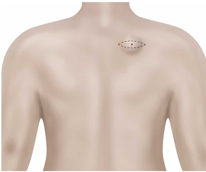
Removing a sebaceous cyst