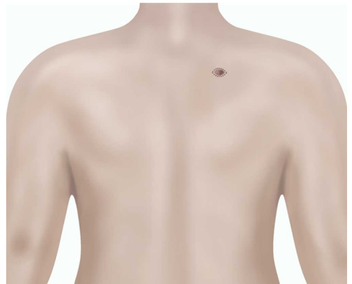
Removing a mole

To remove a lipoma, your surgeon will make a straight cut on your skin directly over it. The lipoma is freed up from the tissues around it and removed. They will close the cut with stitches which, depending on the operation, can be removed in about 5 days.